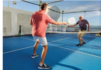
FITNESS CENTER & SPORT DECK