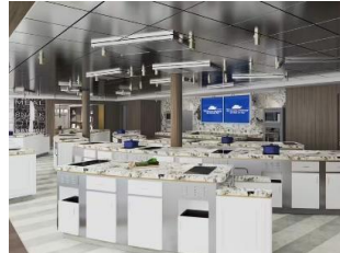
THE CULINARY CENTER