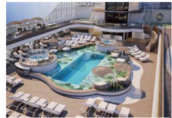
RELAX BY THE POOL