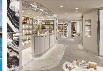
BOUTIQUES & MORE