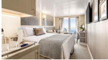
CONCIERGE LEVEL VERANDA