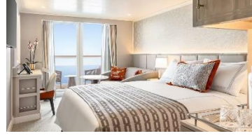
VERANDA STATEROOM (27 SQM.)