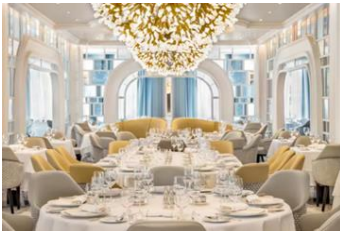
THE FINEST CUISINE AT SEA®