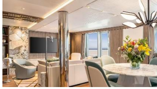
VISTA SUITE (161-171 SQM.)