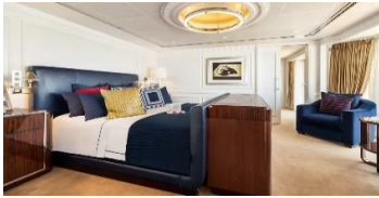
OWNER'S SUITE (223 SQM.)