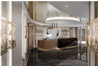
AQUAMAR SPA+ VITALITY