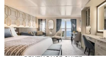
PENTHOUSE SUITE (41 SQM.)