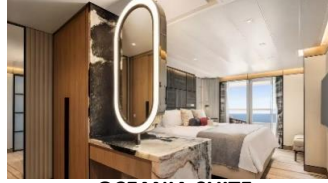
OCEANIA SUITE (89-109 SQM.)